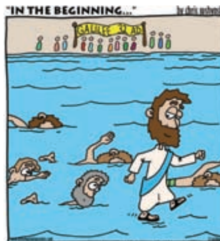
Consequently, Jesus was banned from further triathlons...