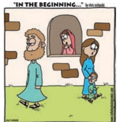
Although scandalous at first, bell-bottomed robes proved to be ahead of their time...