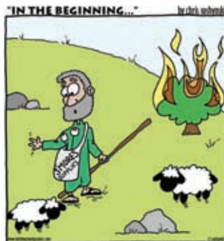
"Dooooo! A burning bush! I can't pass this up!"

To see more examples of the comics, visit www.inthebeginningcomics.com .